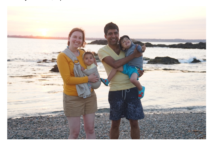
Welcome to SP!

sp-headsofhouse@mit.edu Sidney-Pacific, Apt. #568