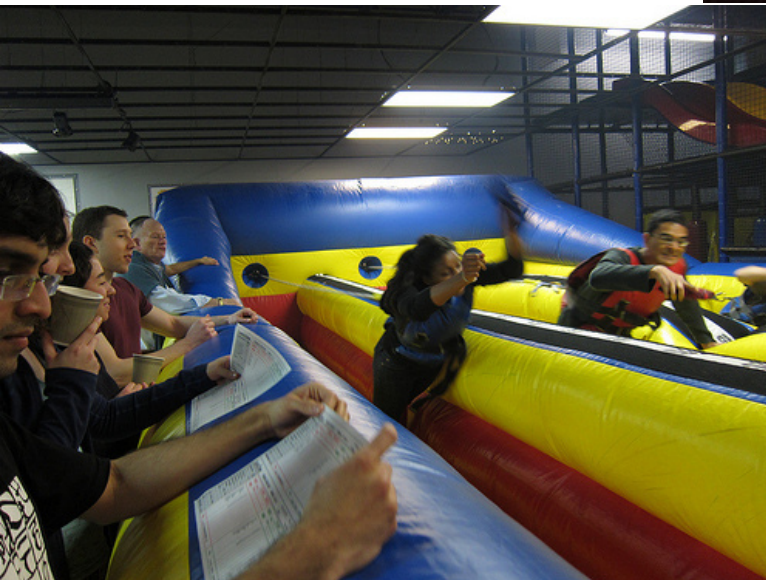
Image: Leaping in the bungee-run for extra distance while others cheer on the sidelines