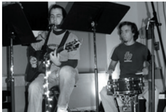
Performers at the S-P Open Mic Coffee Hour.

MIT and Cambridge communities. For anyone interested in understanding better how the tax system works and helping others, this will be a great chance to get involved.